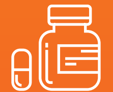
Novel and Emerging Therapies