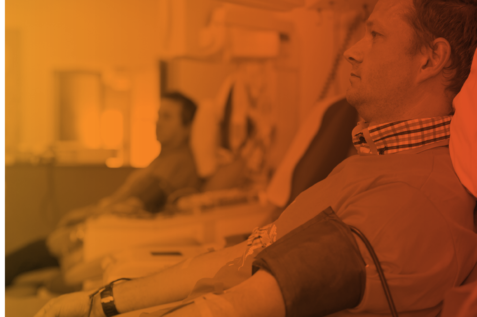
Nonmalignant Hematology Experience: All Phases (Number of Trials)

Our total nonmalignant hematology experience spans 59 studies at approximately 2,000 sites worldwide involving over 4,500 patients. Our global team provides support and specialist staff in over 100 countries.