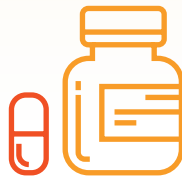
Novel and Emerging Therapies